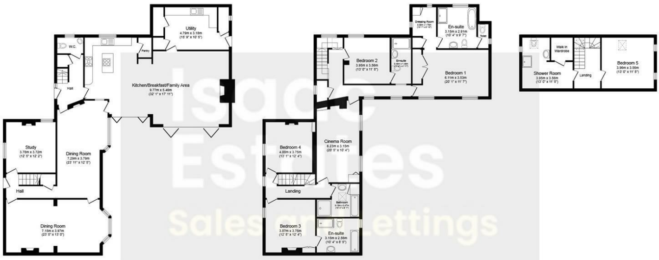
Ground Floor Floor area 163.9 sq.m. (1,764 sq.ft.)